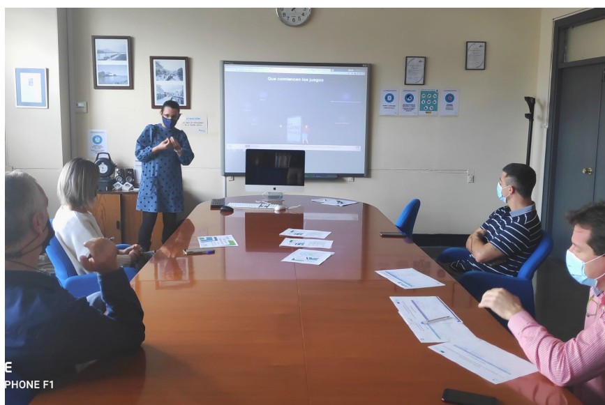
Photo from the pilot event

https://www.facebook.com/gameofphonesproject